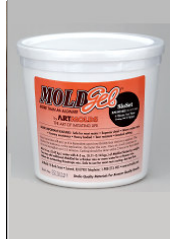
Dust free MoldGel is now available in 2-lb., 10-lb, 20-lb, and 50-lb containers

ArtMolds products are now widely available throughout the world. For distributor information please call toll free at 1-866-ARTMOLDS (278-665) International, please call 1-(908) 273-5401.